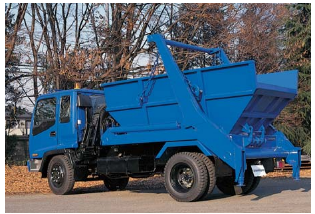
▲ Completion to load the container