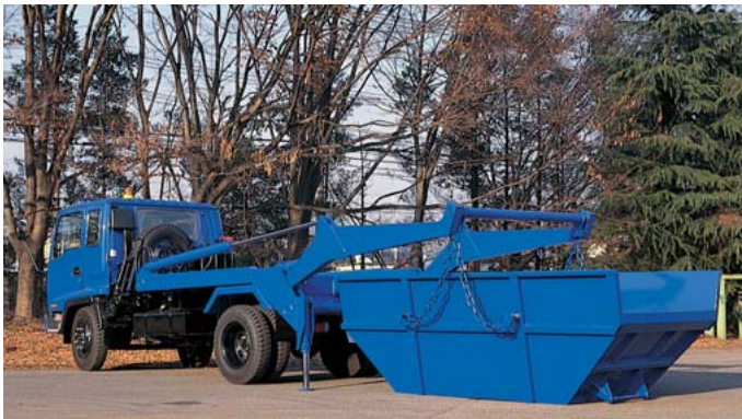
▲ Putting chains to hooks of the container