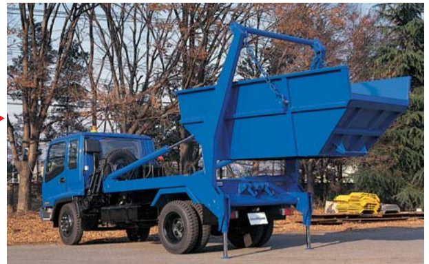
▲ Hanging the container in a level position