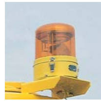
▲Rotating beacon lamp