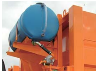
▲Water tank with pumping system for washing