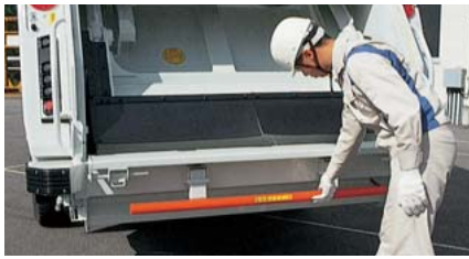
▲Switch bar for emergency stop