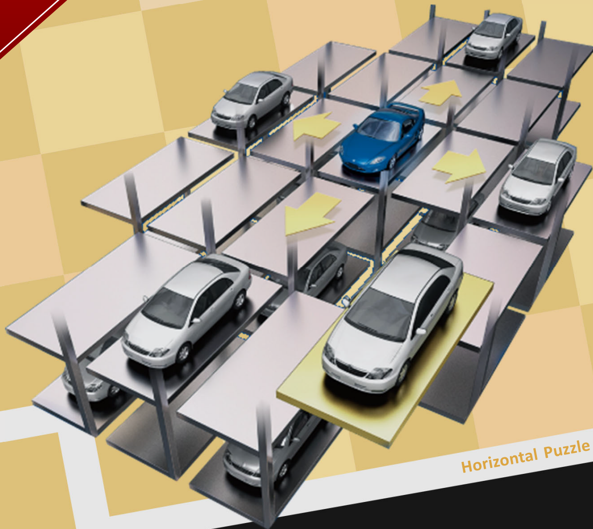
Horizontal Puzzle Type