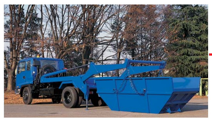
▲ Putting chains to hooks of the container